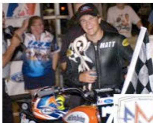
2007 AMA Pro Expert twin win which lead to the Championship